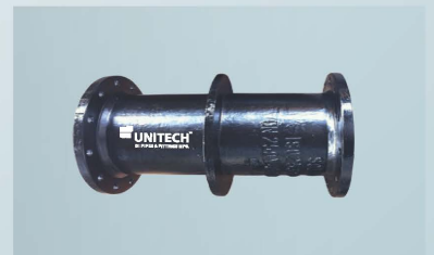
Double Flanged Puddle Pipe, K12/K14 Nominal Size : 80mm - 2200mm