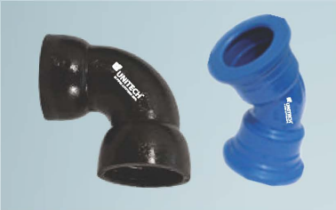
Double Socket Bends, K12/K14 Nominal Size : 80mm - 2200mm