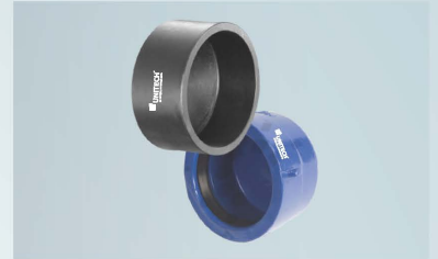
Caps, K12/K14 Nominal Size : 80mm - 1800mm