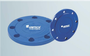
Blank Flange, K12/K14 Nominal Size : 80mm - 2400mm