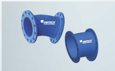
Double Flanged Bend, K12/K14 Nominal Size : 80mm - 1800mm