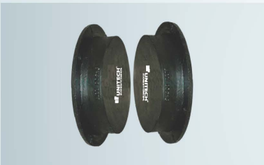
Plugs, K12/K14 Nominal Size : 80mm - 1800mm