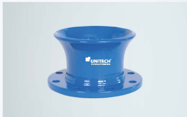
Bellmouth, K12/K14 Nominal Size : 80mm - 1800mm