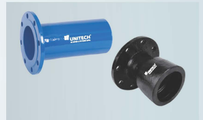
Flange Spigot & Socket, K12/K14 Nominal Size : 80mm - 1800mm