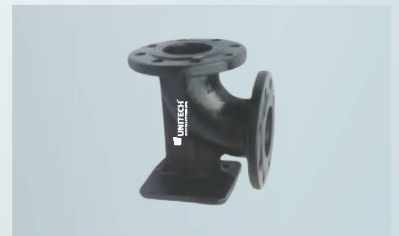
Double Flanged Duckfoot Bend, K12/K14 Nominal Size : 80mm - 1800mm