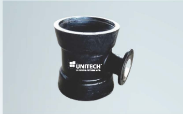
Double Socket Invert Tee with Flanged Branch K12/K14, Nominal Size : 200mm - 1800mm