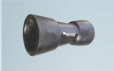
Double Socket Concentric Tapers K12/K14, Nominal Size : 80mm - 1800mm