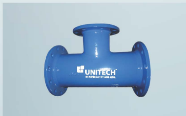
All Flanged Tee, K12/K14 Nominal Size : 80mm - 1800mm