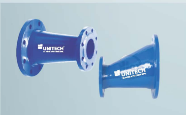
Double Flanged Tapers, K12/K14 Nominal Size : 80mm - 1800mm