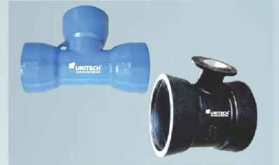
All Socket / Flange on Double Socket Tees K12/K14, Nominal Size: 80mm - 1800mm