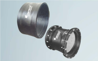
All Colars, K12/K14 Nominal Size : 80mm - 1800mm